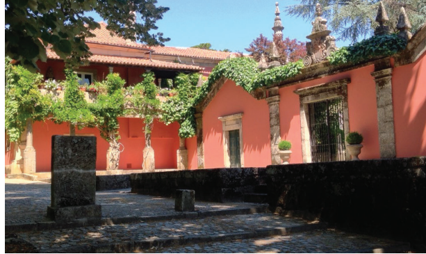
Casal de Valle Pradinhos