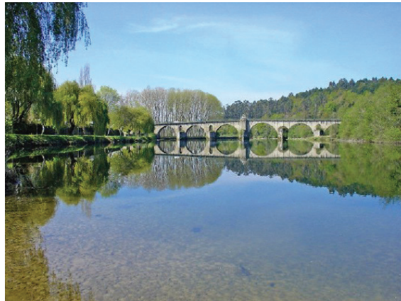
Bridge over river Lima